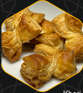
Khari & Cookies