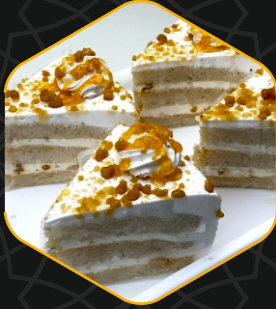
Pastries & Cakes